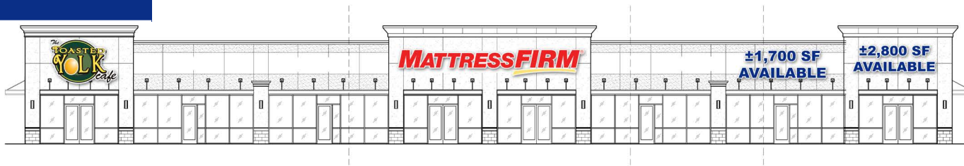
02 FRONT ELEVATION SCALE: 1/8" = 1'-0"